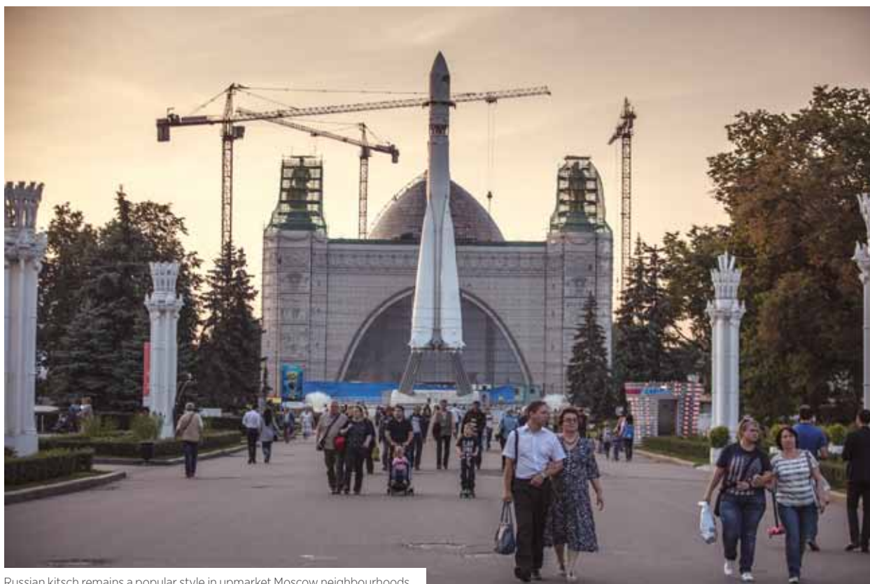
Russian kitsch remains a popular style in upmarket Moscow neighbourhoods

Cheremushki, Cheremushki... In every room, on every floor Municipal happiness! A Heavenly place without a trace, Of a dark and gory past...Paradise at last.