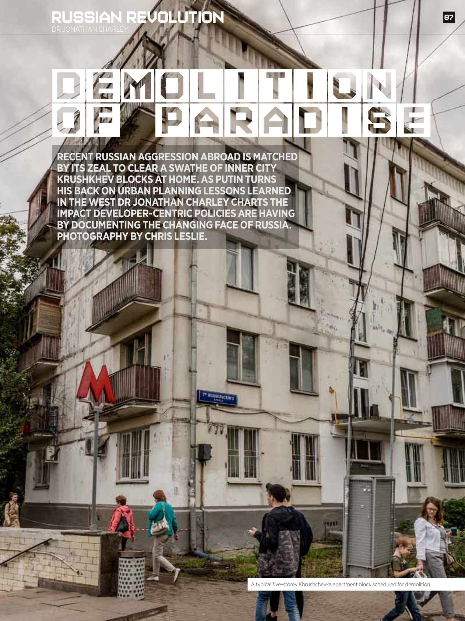
A typical five-storey Khrushchevka apartment block scheduled for demolition