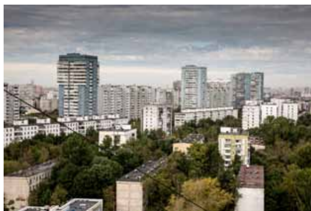
For thirty years the Russian construction industry remained devoted to the industrialisation of house-building such that as you look out across Moscow you can see the shifts in government policy clearly demarcated as concrete panels, storey heights and neighbourhood increase in size until you reach the forests of thirty storey towers on the periphery.

Of course the process of real estate speculation and of decanting and dispersing communities is hardly unique to Moscow. It has been going on since the credit fuelled speculative frenzy of Haussmann's reconstruction of Paris after the 1848 revolution and its essential mechanisms are features of neo-liberal urban development wherever it takes place. This means that a crisis triggered by the over production of property is a real threat and perhaps the only thing short of a mass uprising that will bring the demolition programme to a halt. The one sure thing about a construction boom is that it is followed by a slump. When the quantity of housing exceeds market demand, the value