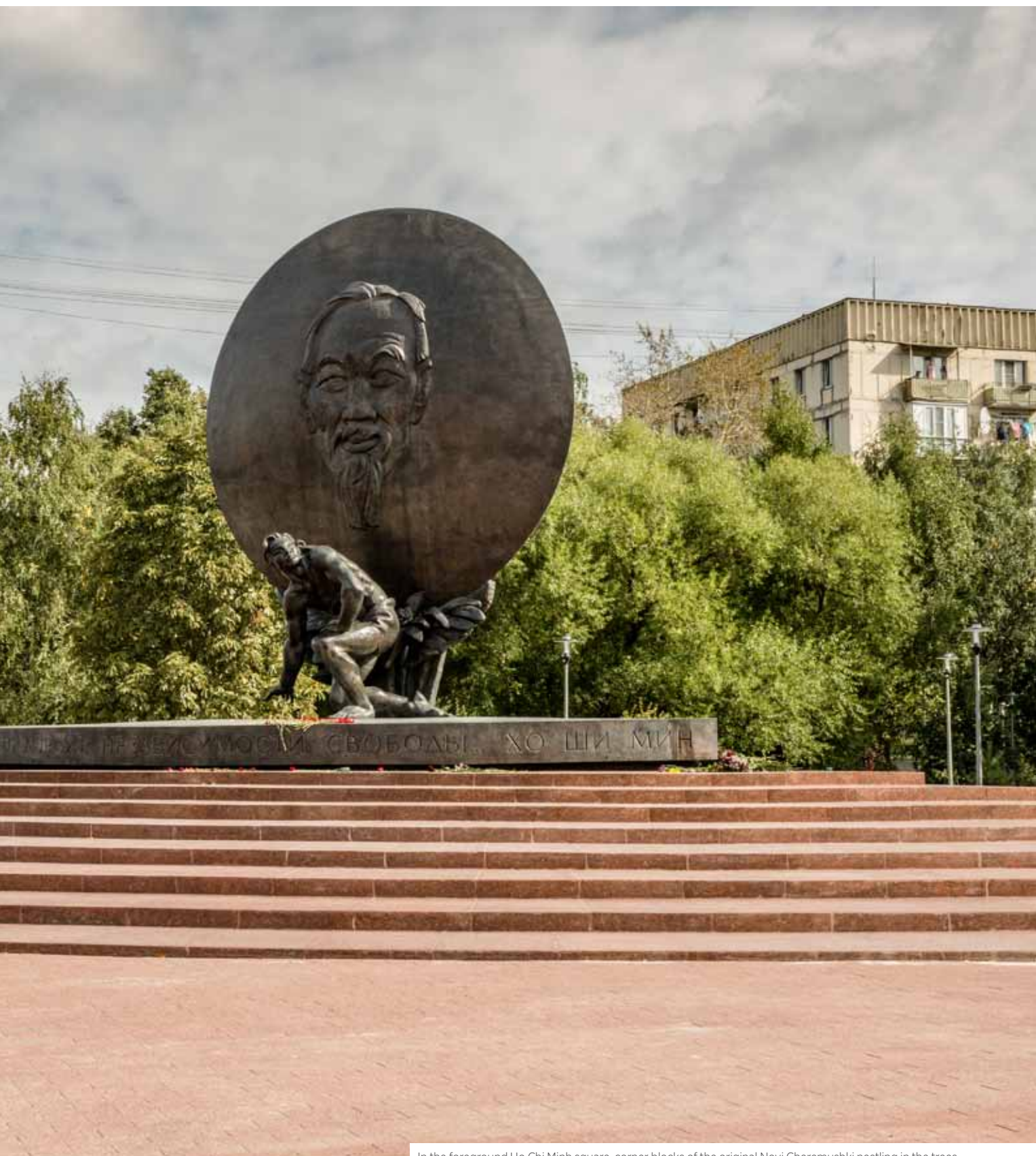
In the foreground Ho Chi Minh square, corner blocks of the original Novi Cheremushki nestling in the trees